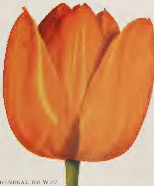
GENERAL DE WET

GENERAL DE WET. (Single Early). Sweet scented flowers of deep orange stippled with orange scarlet. 3 for 50c 12 for $1.80